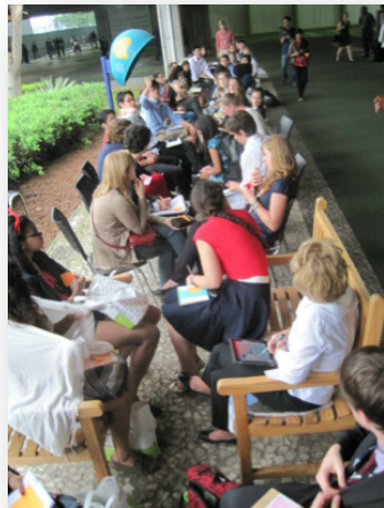
Green Dating within the Major Group of Children and Youth (MGCY) in Rio+20

- Ice-breaking activity, the “Green Dating”: everyone knows the principle of speed dating. If you organise an activity or event in which participants come from very different backgrounds, a “green” dating can be a nice way to introduce everyone shortly by putting two rows of chairs in circle and asking people to change seat every 5 minutes. For any interactive workshops, an ice-breaking exercise is generally recommended to create a pleasant atmosphere.