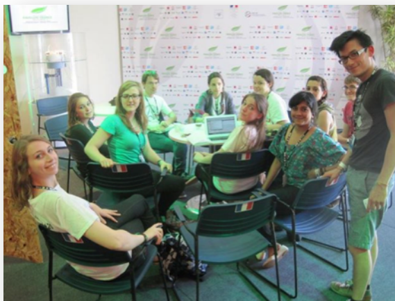
The MyCity+20 team in the Rio+20 Earth Summit