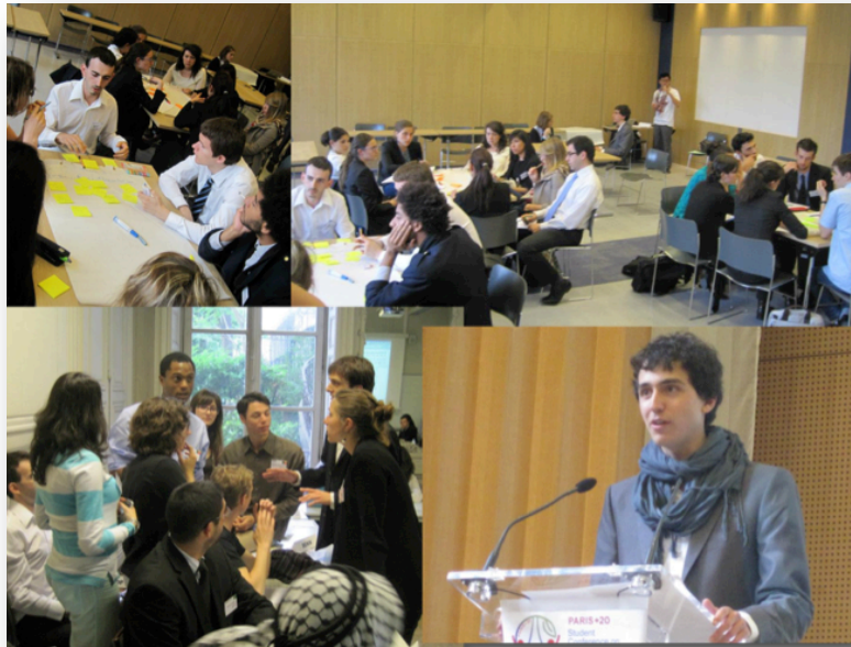
Simulation and Open Space during Paris+20, the French initiative of MyCity+20

Interactive trainings about climate change issues and negotiations process can be organised with high school students, university students and citizens. CliMates provides a presentation 2 in English that can be adapted to the local context.